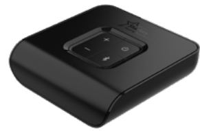
| TV |

Stream audio from your TV or other electronic audio source directly to your Livio AI hearing aids. It offers excellent sound quality, is easy to use and supports both analog and digital input sources.