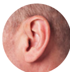
RIC 312 Receiver-In-Canal