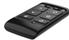
| Remote |

Easily stream from a variety of audio sources. And thanks to Remote Microphone +, Livio AI is the first hearing aid to feature Amazon® Alexa connectivity.